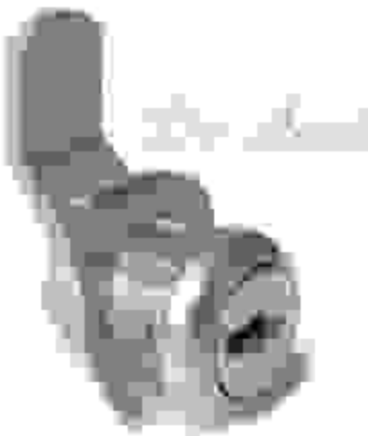
Low Security Lock

The key number which appears on the front of the lock also represents the key this is a big security risk as anybody can take that number and reproduce and he from their local locksmith and come and access that mailbox with the key without any resistance and without any form of suspicion from the neighbors because they are using a key.